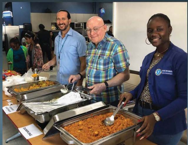
Kittitian Good Friday Meal