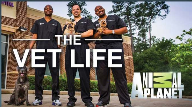
Black History Month with the cast of The Vet Life

The RUSVM Diversity Committee recognizes various special dates and moments. The committee is dedicated to sharing information with students so they become well-rounded, culturally-aware professionals.