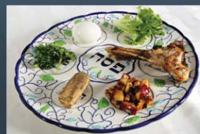
Jewish Passover Seder Meal