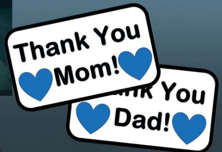
Mother's and Father's Day