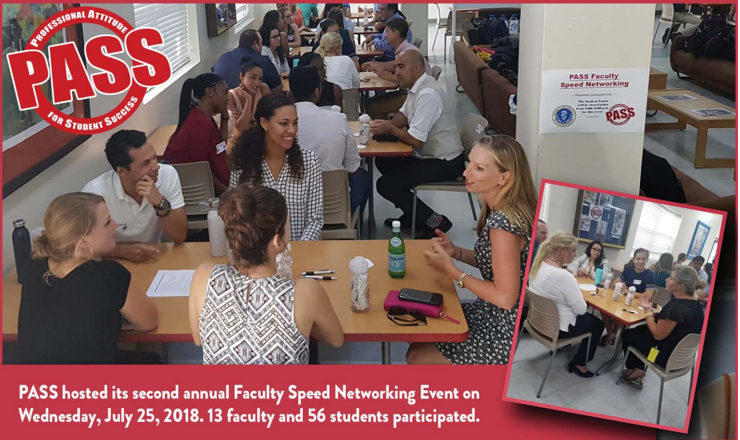
PASS hosted its second annual Faculty Speed Networking Event on Wednesday, July 25, 2018. 13 faculty and 56 students participated.