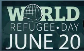
World Refugee Day