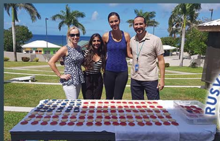
US Memorial Day