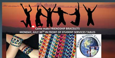
International Friendship Day